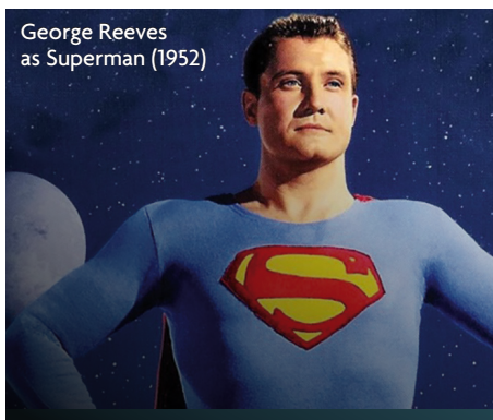
George Reeves as Superman (1952)